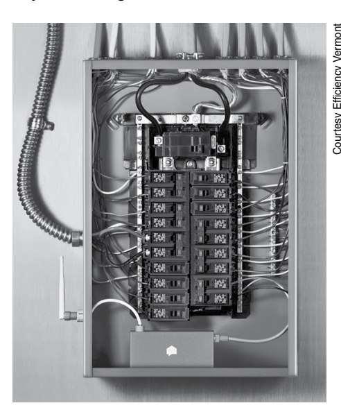
A Sense monitor installed on a circuit breaker panel.

appliances for more energy-efficient ones. The team at Efficiency Vermont says installing a Sense monitor tends