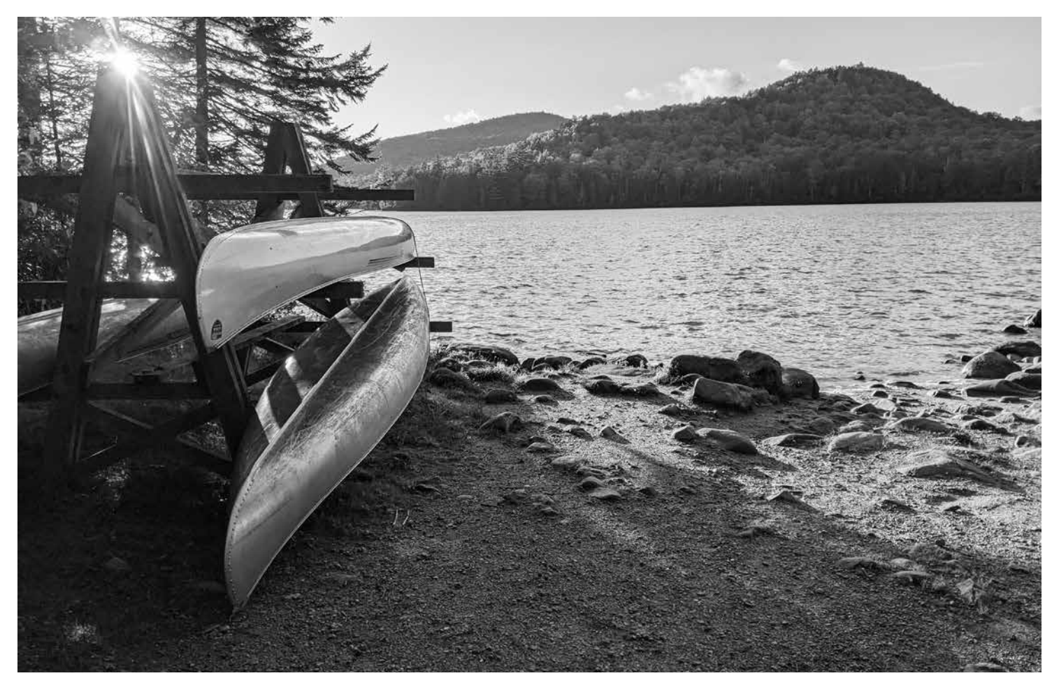
Fall came late to Kettle Pond in Groton State Forest this year.