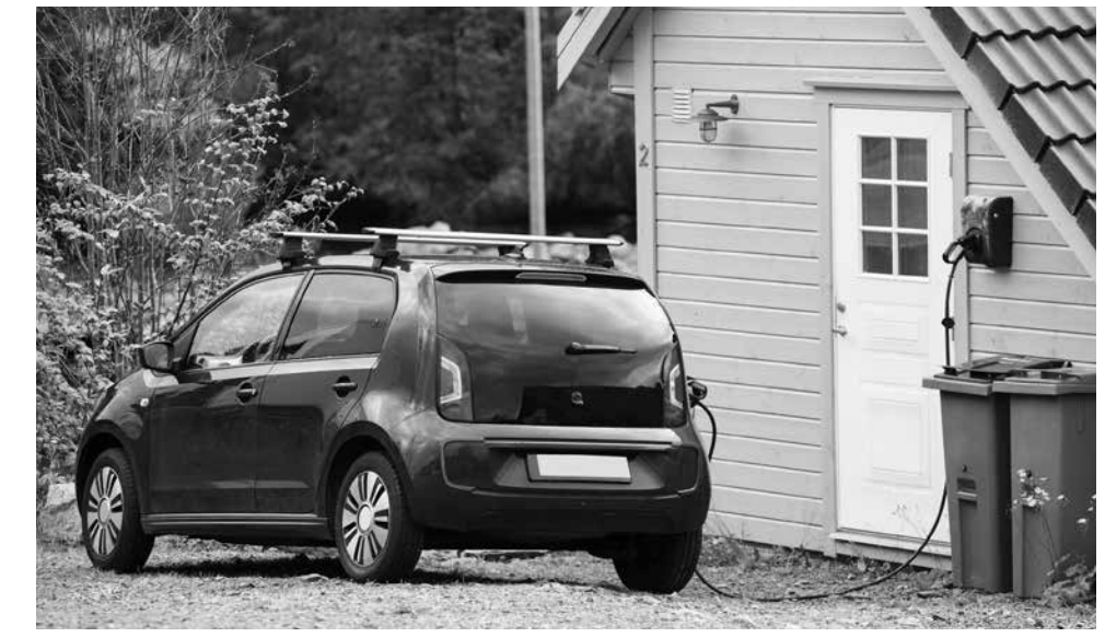
Shopping for a new vehicle? An EV is a great choice. But before you buy, call WEC to see if you need to update your circuit breaker box, wire, or transformer.

Powell, known throughout WEC service territory as The Energy Coach, points out that most EV drivers charge at home, and that charging a vehicle draws a lot of energy for a long period of time. While it's still overall cheaper to charge an EV than to keep filling a gas tank, Powell explained that EV purchasers need to make sure that their