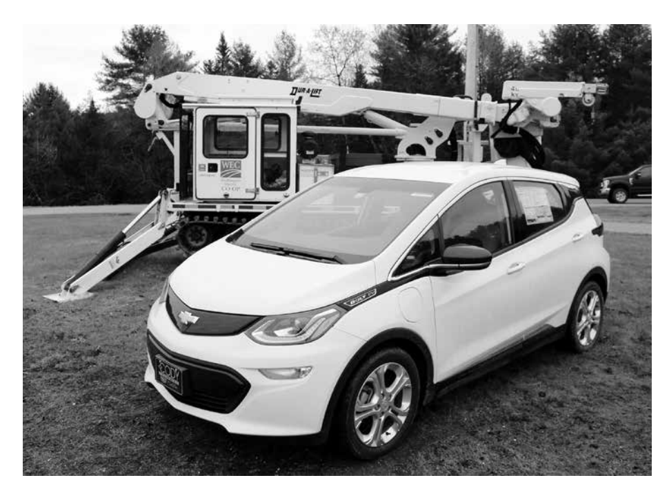
An all-electric Chevy Bolt outside WEC's warehouse. Supply chain tie-ups mean members wishing to add to their load – for instance, to add a Level 2 EV charger - need to wait for elective services. These will be resolved as inventory becomes available. But, according to Energy Coach Bill Powell, you may be just fine charging your EV without a Level 2 charger.

Members drawing more power without adding more capacity is a persistent and avoidable problem, said Kresock. It damages the system, and that gets expensive. Members may already know they need a licensed electrician to determine if upgrades are needed for internal wiring or circuit breakers. But members also need to call WEC to make sure they have enough capacity to add devices that add to