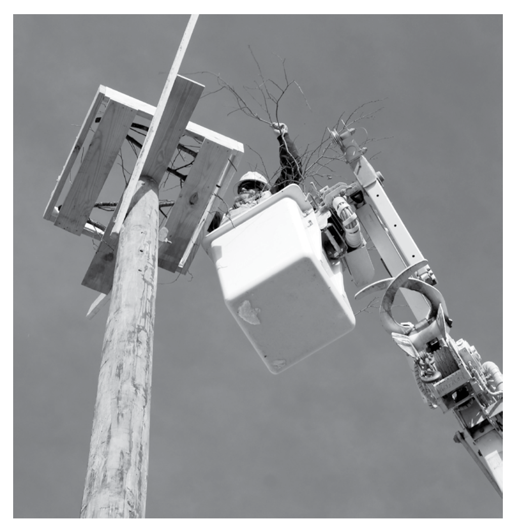
Turner arranges sticks on a four-foot-square platform to entice nesting osprey.